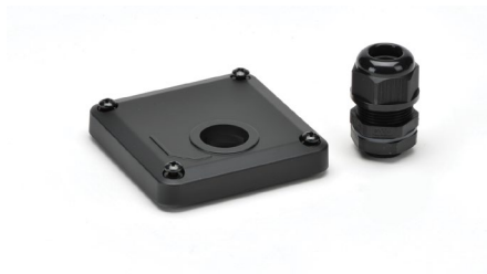
Power Back Cover w/ Cable Gland Part No. MD-PWR-COV