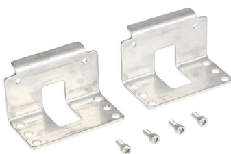
Chain Mount Brackets Part No. MD-BRK-2