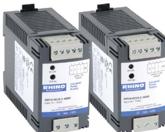
PSP 60 Watt DC-DC Converters