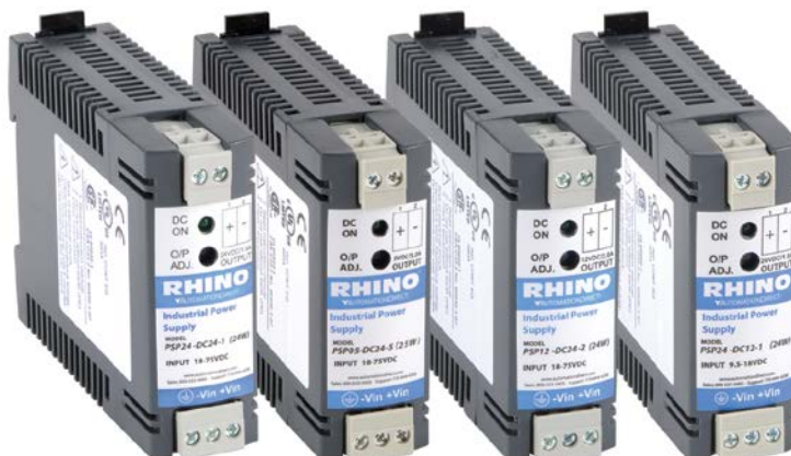
PSP 25 Watt DC-DC Converters

Please note: $US prices shown For current $AUD visit www.directautomation.com.au