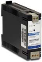
PSP05-020S PSP12-024S PSP24-024S