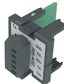
Removable Connector Included

For current $AUD visit www.directautomation.com.au