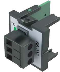
Removable Connector Included