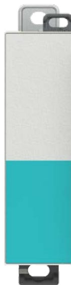
P1AM-PROTO (with overlay applied)