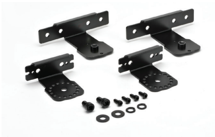
Wall Mount Bracket Part No. MD-BRK-1