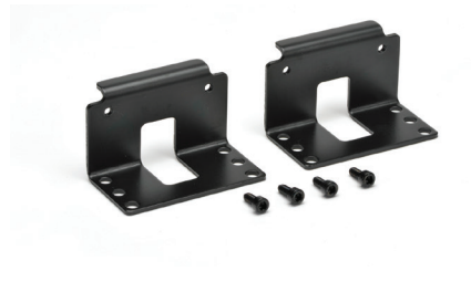
Chain Mount Brackets Part No. MD-BRK-2