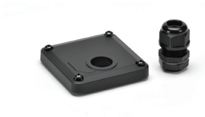
Power Back Cover w/ Cable Gland Part No. MD-PWR-COV