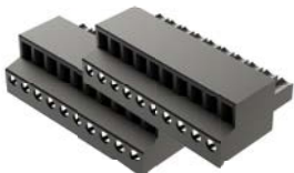
BX-RTB10-2 (Kit - 2 pieces)