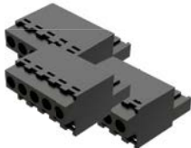
BX-RTB08-2 (Kit - 3 pieces)