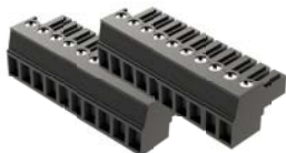
BX-RTB10 (Kit - 2 pieces)