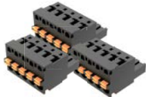
BX-RTB08-1 (Kit - 3 pieces)