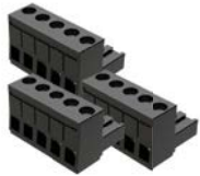
BX-RTB08 (Kit - 3 pieces)